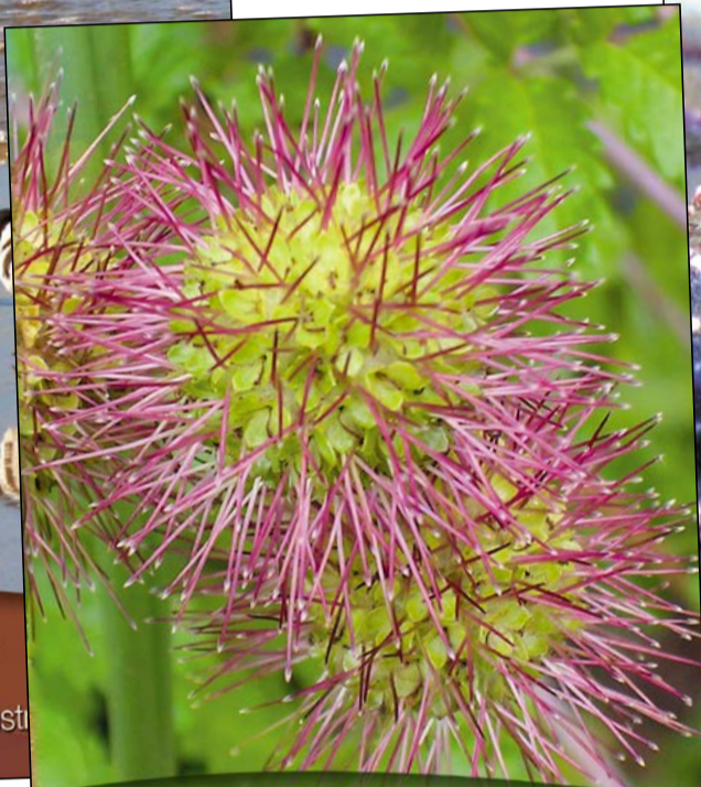
Plants that Clothe the Bluff Barwon Heads, Victoria, Australia. Reprinted 2009.