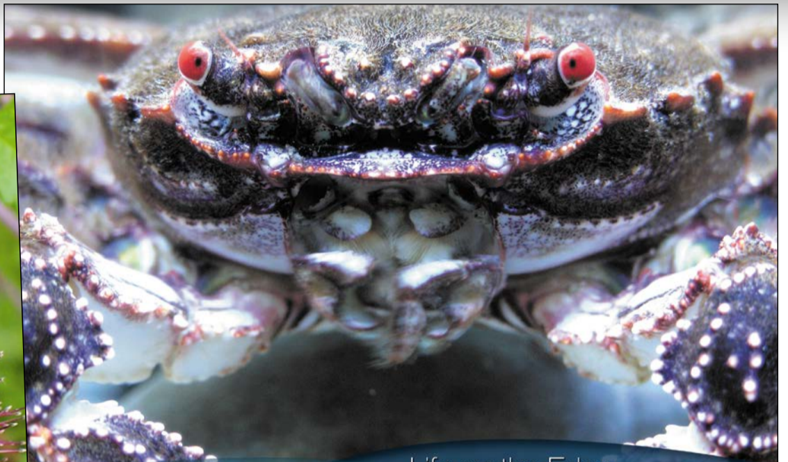
This booklet has been produced by Friends of the Bluff in association with Parks Victoria. Cover image: Plagusia chabrus - Red Notched Crab.