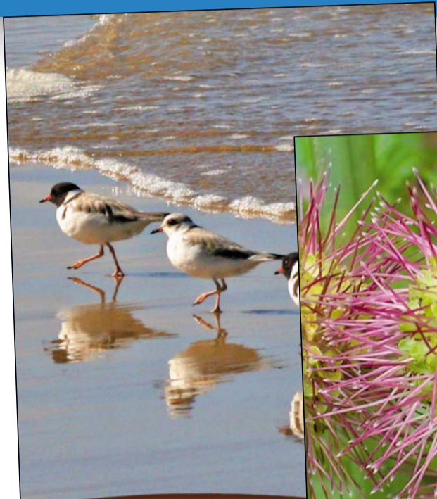
Birds of the Bluff Barwon Heads, Victoria, Australia

Barwon Coast recognises the valuable contributions that volunteers make to our community and the environment we manage.