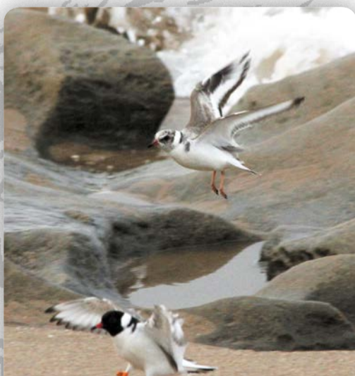
Adult and juvenile bird