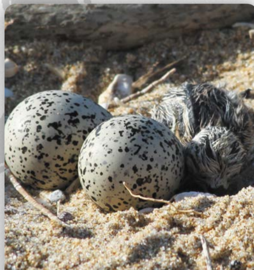
Newly hatched chick