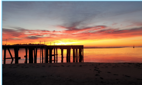
BARWON COAST AS THE MANAGER OF THE LOCAL PORT OF BARWON HEADS ON BEHALF OF THE DEPARTMENT OF TRANSPORT HAVE RECENTLY OVERSEEN MAINTENANCE WORKS ON THE MAIN PUBLIC JETTY DECK.

We have released a Safety and Environmental Management Plan for the local Port of Barwon Heads. This plan examines safety and environmental risks in the local port. We invite community feedback on this plan via email or phone by 31 October 2019. For the full plan www.barwoncoast.com.au/boating