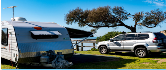
THE BARWON HEADS CARAVAN PARK IS MANAGED BY BARWON COAST.

Planning for the future of our coast is an important part of our work. In 2021 we are developing a Precinct Master Plan (PMP) for our accommodation service businesses.