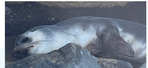
A YOUNG SUBANTARCTIC FUR SEAL RECENTLY WASHED UP ON THE OCEAN GROVE SPIT FOR A REST.

The Department of Environment Land Water and Planning also has an online tool for wildlife response wildlife.vic.gov.au/injured-native-wildlife/wildlife-tool