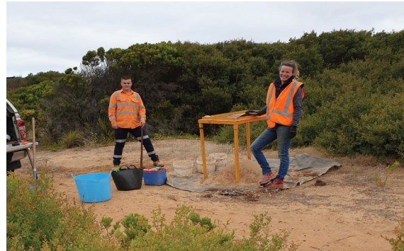
ARCAHEOLOGISTS AND WTOAC FIELD OFFICERS ARE EXPLORING CULTURAL HERITAGE ON THE BARWON COAST